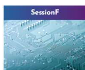
Electronics and Electrical System