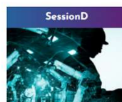
Mechanical Engineering, Robotics and Mechatronics