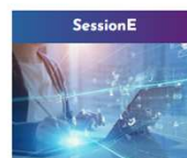
Digital Transformation, Information and Communication Technology