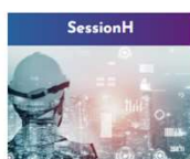
Civil Engineering, Environmental Engineering and architecture